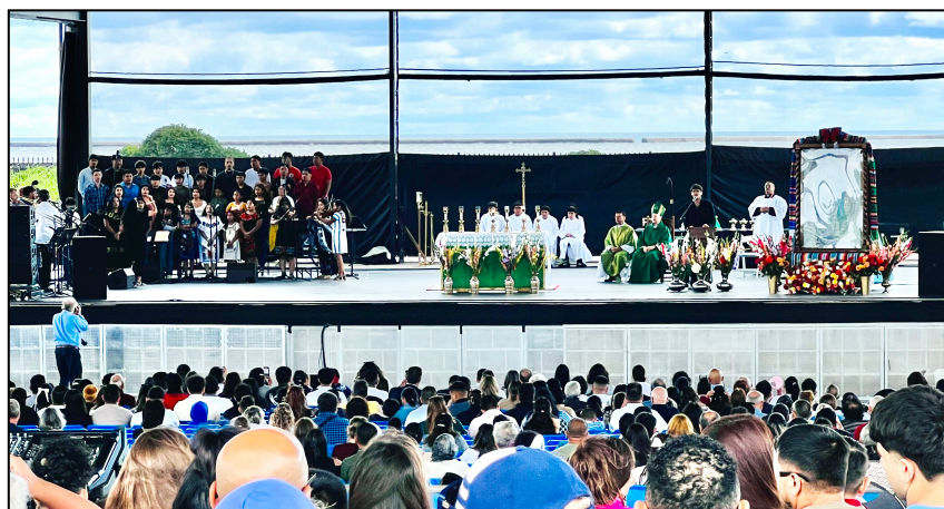
MCG set-up for the Liturgy at Fiesta Mexicana in Milwaukee.

It is often said that our Mission here at MCG always has us on the move . Certainly our Mobile Sacristy and JP2 Traveling Monstrance programs give the up-front appearance that